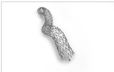
(BioMimics 3D Vascular Stent)