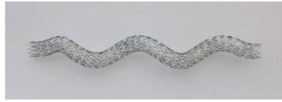
Figure 3: BioMimics 3D helical stent